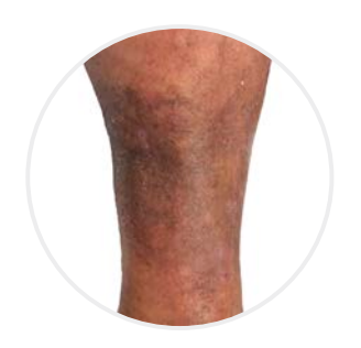
Skin color and texture change